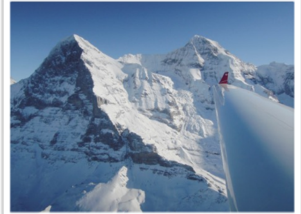
A sightseeing flight over the Alps from Zweisimmen aerodrome is a gorgeous experience! Here in the Super Dimona in front of Eiger, Mönch and Jungfraujoch.