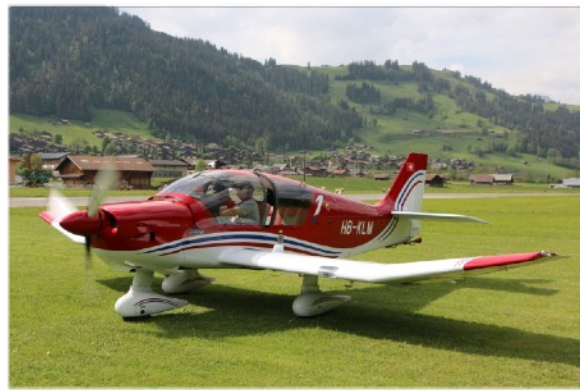
In the four-seater Robin, you can invite two more people beside you. What a great gift to your loved ones! And the price remains the same.