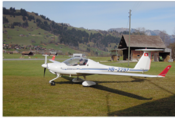
The two-seater Super-Dimona is ideal for introductory flights. Be at the controls of a private aircraft today!

Where and how long, you're asking? Basically, you can put together your own sightseeing tour. The price is 5.50 Swiss Francs per minute in the air. On the flip side of this brochure, you will find some flat rate suggestions to suit your budget.